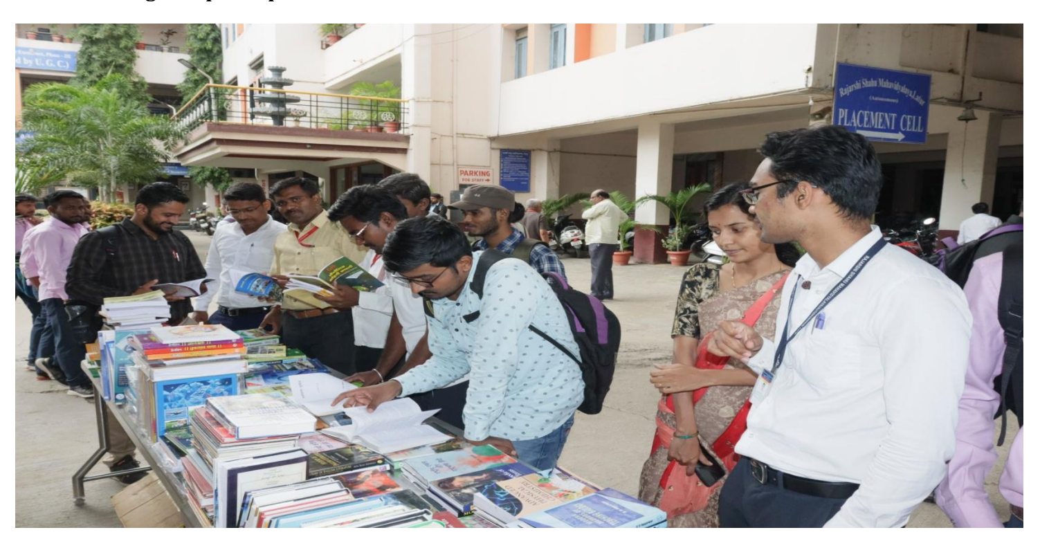
Students participated in the book exhibition