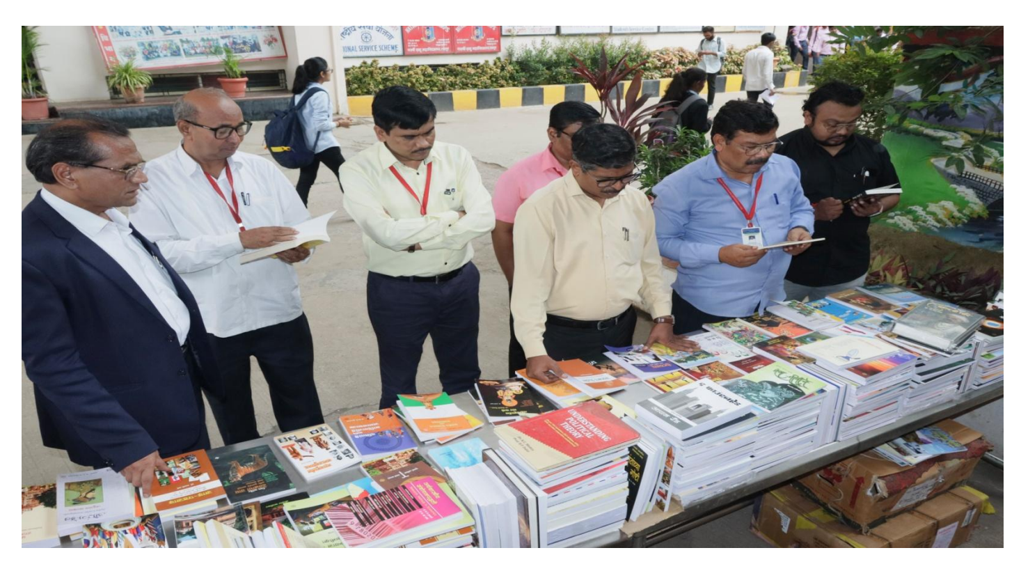
Teaching staff participated in the book exihibition